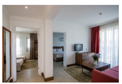
Figure 2 +1 family room