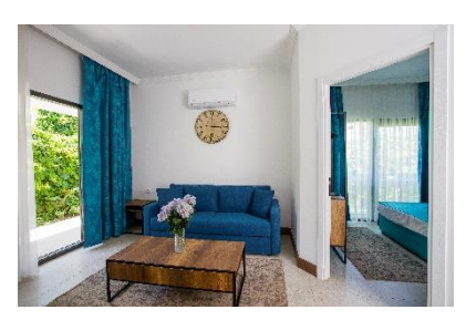
Figure 1 +1 family room